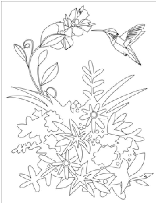
Spring time coloring page.